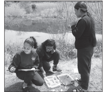
Girls from the Nora Cronin Academy record their pond study findings (above) and try out binoculars (below).

We thank you all for supporting the Museum in the past and sincerely look forward to your participation and good will in 2015.